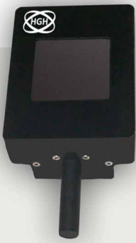
→ DCN1000 W2