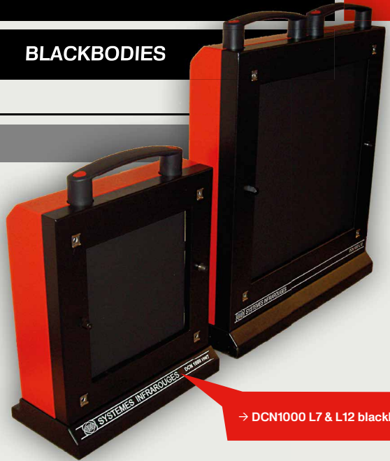
→ DCN1000 L7 & L12 blackbodies

The emissive head also includes a target support. Temperatures of both the target and the emissive surface are measured in real time thanks to high precision calibrated Pt sensors. Various emissive area sizes are available to suit different applications, i.e. characterisation of thermal imagers (MRTD, LSF and NETD targets), calibration of focal plane arrays, non-uniformity correction of infrared sensors, etc.