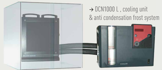
→ DCN1000 L, cooling unit & anti condensation frost system