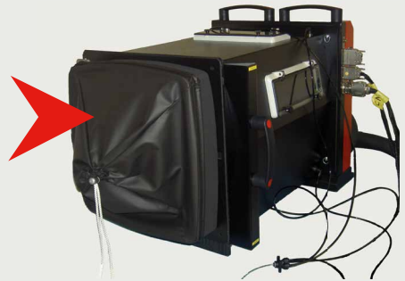
→ DCN1000 L12 and anti condensation frost system