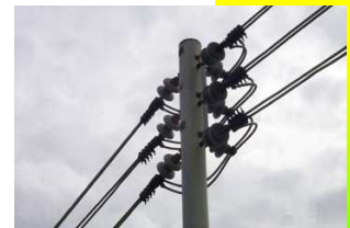
Electrical line to line jumper