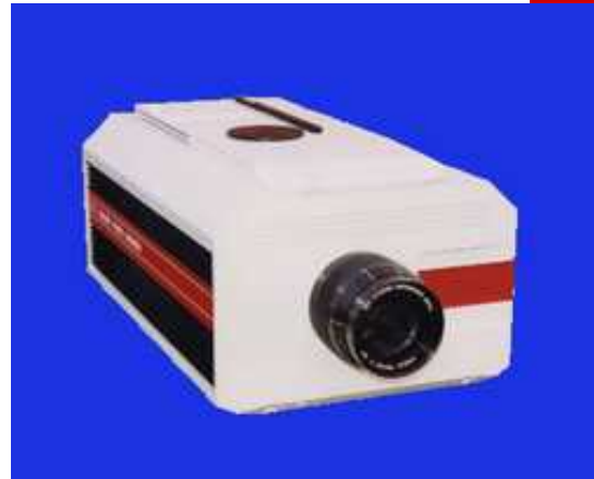
IRCAM optical sensor head