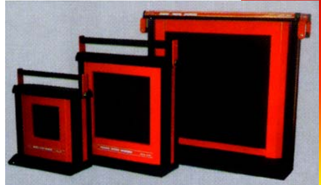
ECN100 family blackbodies