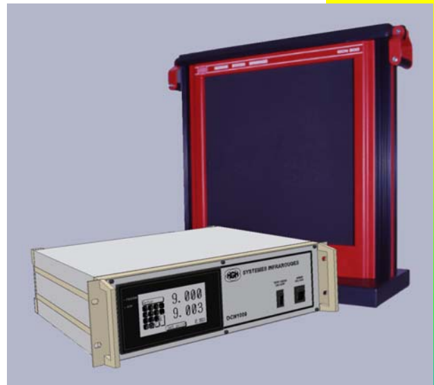
ECN100N20 + electronic unit